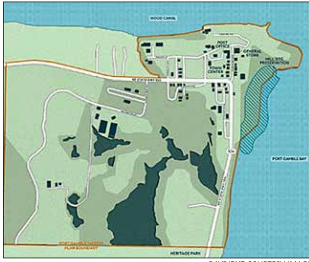
The master plan area in Port Gamble.

Infrastructure work has already begun, focusing on the phased replacement of water and sewer facilities, and a new road has been constructed for the mountain bike ride park at Port Gamble Forest Heritage Park. New buildings are not expected in town for another