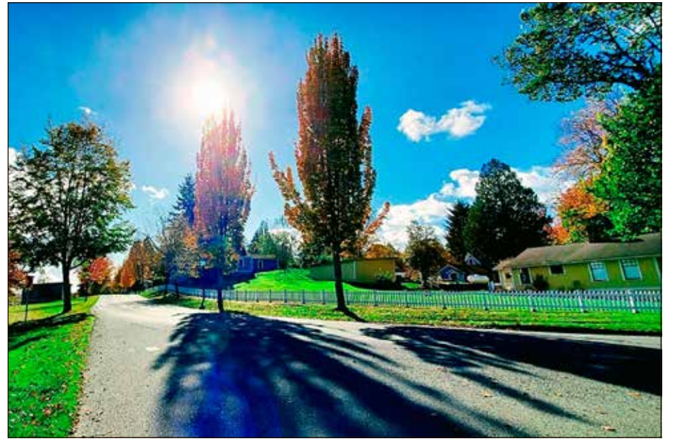
A sunny day in Port Gamble.